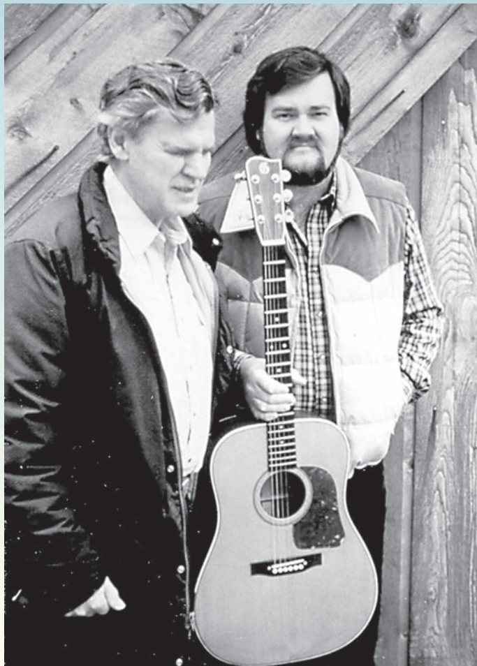
Merle and Doc Watson

“Maybe I can get it out,” Merle said. “I’ve got to have my arm. I have to pick the guitar. Have you got a knife and something for the pain?” They didn’t have anything for the pain except for some wine. Merle sterilized the knife with the wine, drank some as an anesthetic, and success-