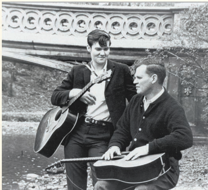
Merle and Doc Watson - Early years

As a testament to Merle’s popularity and musical accomplishments, one of the world’s most renowned gatherings of acoustic musicians began two and a half years after Merle’s death and continues today, 27 years later, to honor the memory of a great talent silenced too early.